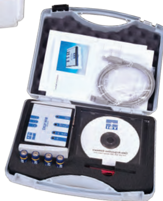
Data Hub for infrared data transfer

Ideal solution for simple, accurate COD measurements